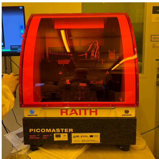
PICOMASTER 100 Optical Lithography System