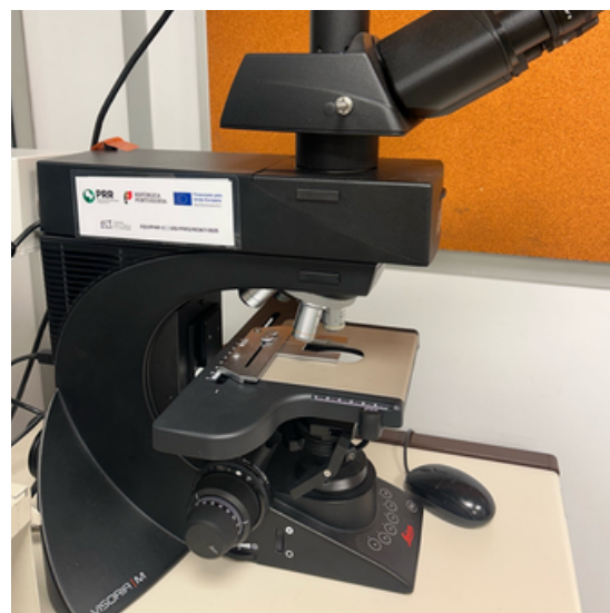
Leica Visoria M stand Microscópio de fluorescência