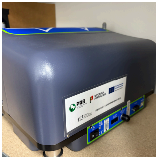
CornerStone CS260B-2-MC-A Monochromator